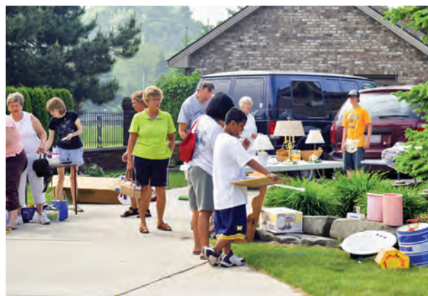
■ yard sale

yard 2 (yärd) noun 1. A piece of ground near a building: I mowed the grass in the side yard. 2. An area, often fenced, that is used for a purpose or business: We took our old car to the junk yard. 3. An area where railroad cars are stored, repaired, or joined together to form a train.